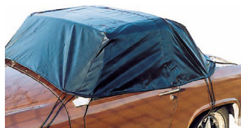
RHINO COVER MIDGET & SPRITE