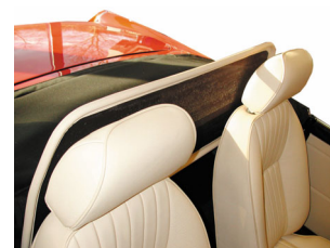
MESH WINDSTOP MGB OR MIDGET