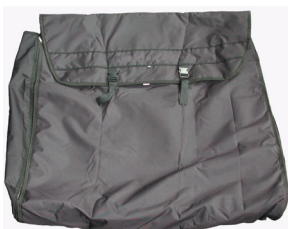
HARDTOP STORAGE BAG MGB & MIDGET