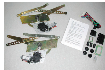
ELECTRIC WINDOW KIT MGB, V8 & MGC