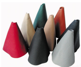
LEATHER GEAR LEVER GAITER MGB OR MIDGET