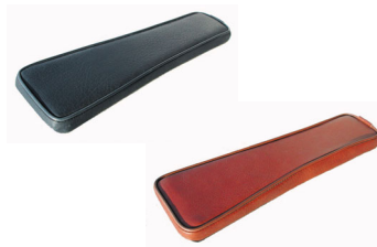
LEATHER CONSOLE ARMREST MGB